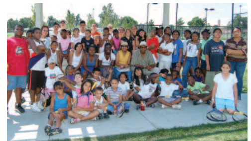
The last day of Net Results summer camp.