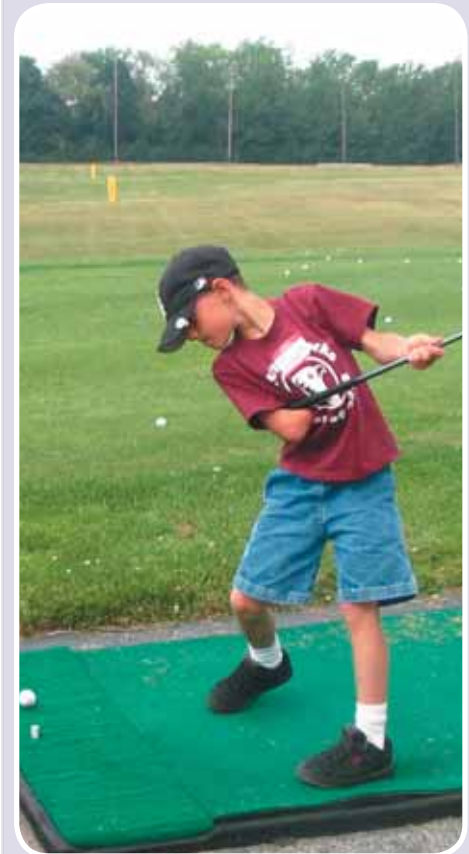
First Swing Participant

Word of mouth is the best form of advertising for a First Clinic. Let people know what you're doing for your patients and your community. The greater the effort you put towards promoting your First Clinics, the more participation and involvement you are likely to have. So spread the word. Get people talking about the exciting things OPAF can provide to your facility and your patients!