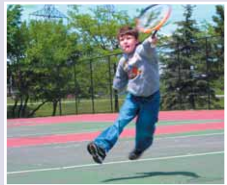
First Volley Participant

You, as hosting facility, are asked to secure attendees & volunteers (volunteers will serve as ball chasers) and to provide refreshments for the group. After that, just sit back and enjoy your clinic! OPAF will take still photography and provide a press release with photos to follow up with the clinic. The charge for hosting a First Volley Clinic is $2500.00, which covers OPAF's travel expenses, as well as the professional fees for the tennis instruc-