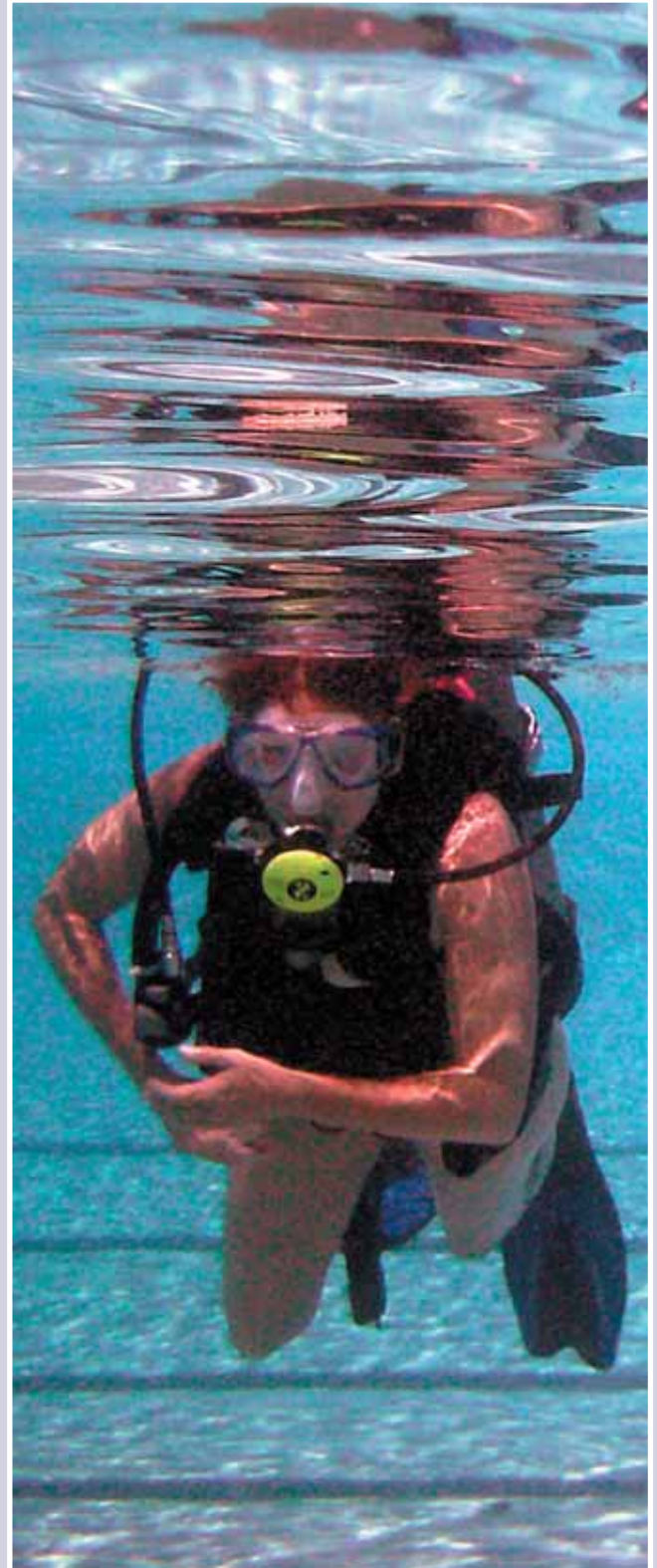
First Dive Participant